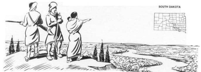
Conserve and develop.....natural and human resources.

This past quarter has kept members active with monthly council meetings and their sponsor/project meetings. In addition, the council is in the beginning stages of updating the 5-Year Area Plan. The council has developed a survey questionnaire designed to get individual and community input. The council is also updating their website pages and will be kicking off an effort designed to inform the public about its mission, goals, and many projects. The goal of this effort is to recruit volunteers and potential new council members. Stay tuned for an exciting year.