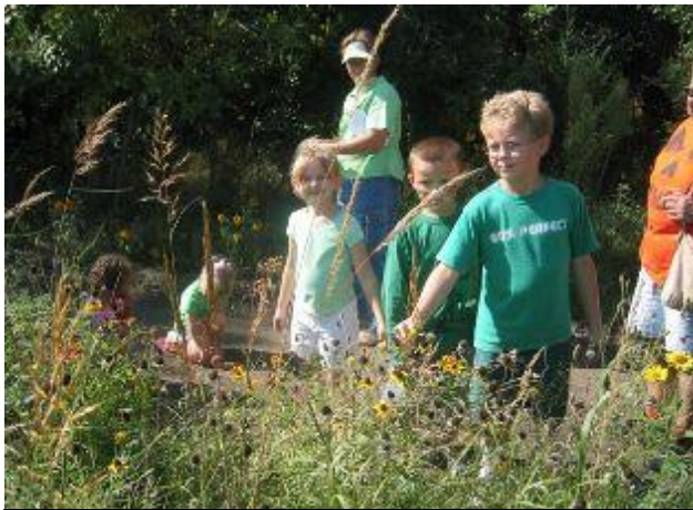
Children enjoying a nice sunny day at the Native Prairie Garden.